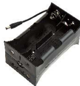
8 D Cell Battery Holder